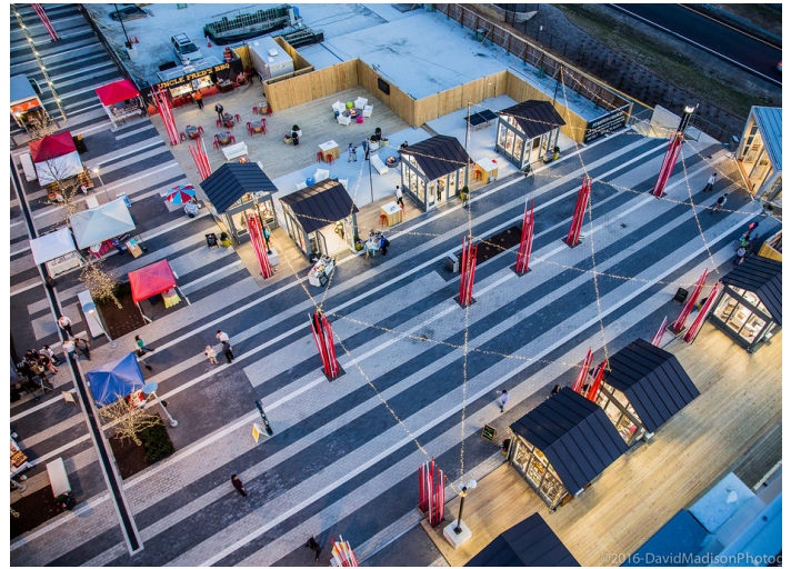
Creating enjoyable public spaces | Image Credit: David Madison Photography