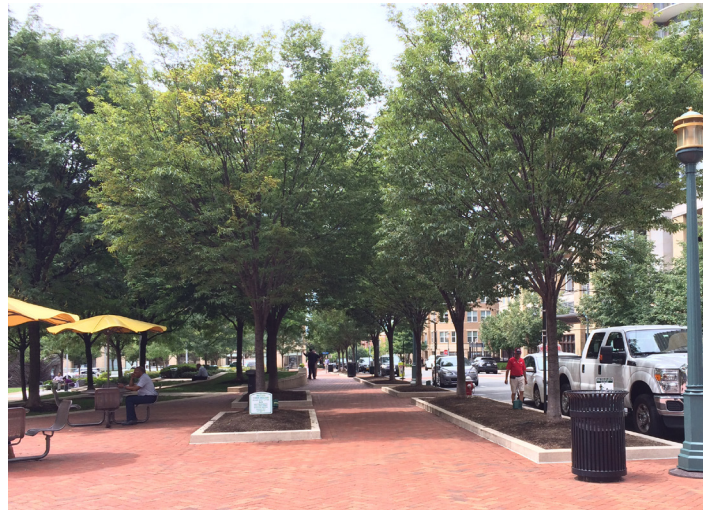
Heavily vegetated streetscapes

To provide input on the Draft Guidelines for Development in the Reston Transit Station Areas: