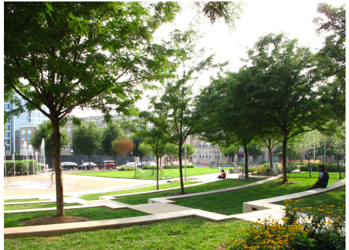
Building upon existing Reston character.