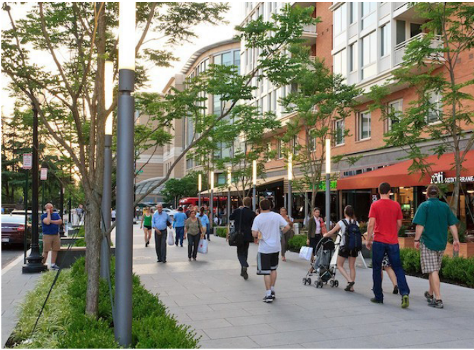
Active pedestrian oriented streets