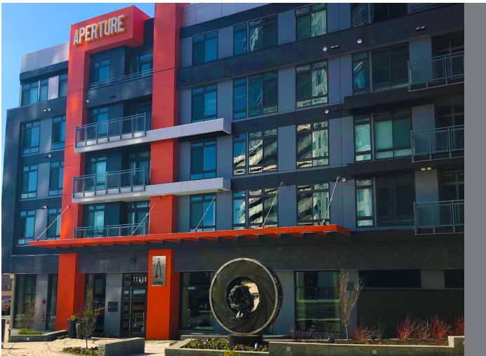
Articulated urban architecture