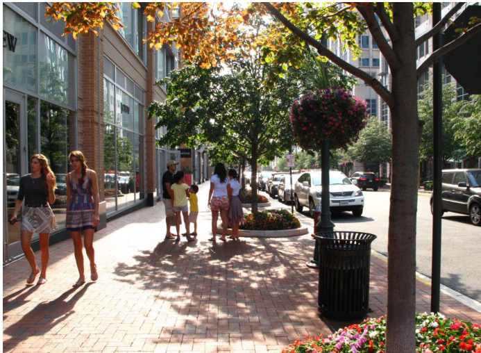
Emphasizing the public realm.

The Development Framework and Vision is the first essential building block of conceptualizing a development in Reston. This Chapter highlights four key elements of developing a property in the TSAs: