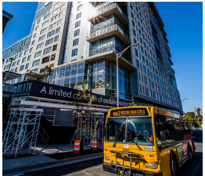
Wiehle-Reston East Metrorail Station