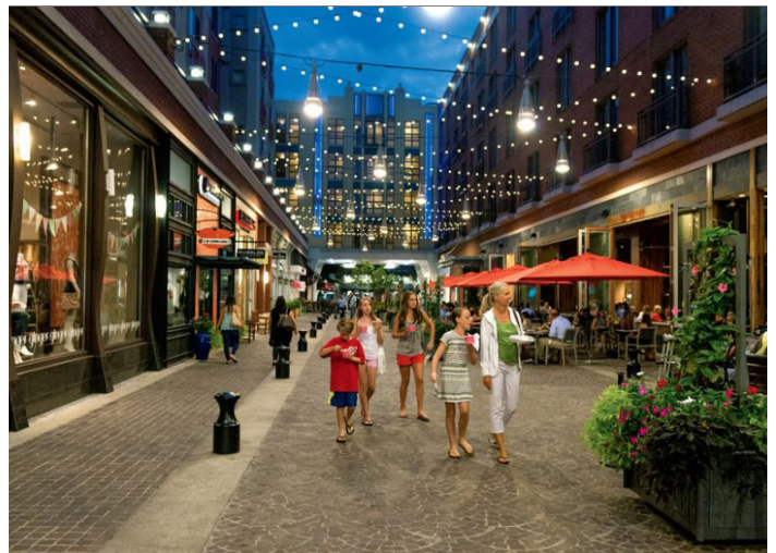
Active pedestrian areas