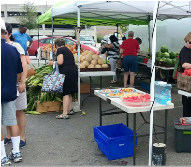
Smart Markets: Springfield