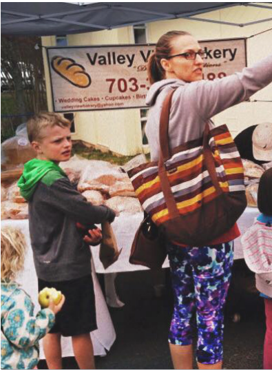
Smart Markets: Oakton