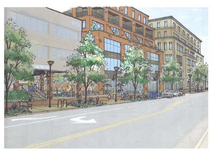
Comprehensive Plan Image: Vision along Elm Street