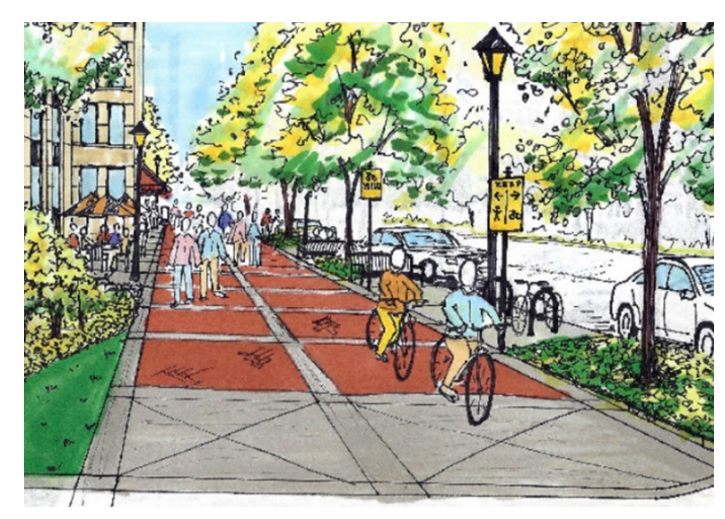
Comprehensive Plan Image: Vision for Old Dominion Drive

communal experiences