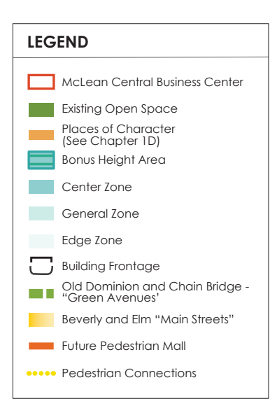
FIGURE 2-2: McLEAN URBAN FRAMEWORK PLAN