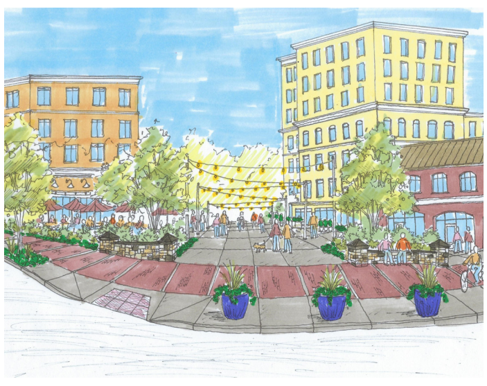
Comprehensive Plan Image: Conceptual rendering of the Signature Urban Park area

The urban design vision for McLean is for it to have a small town feel with a variety of human-scaled gathering spaces that foster social interaction and communal experiences. The diversity of local merchants continues to meet many of the daily shopping and service needs of area residents. Dining options help define McLean as a destination for area residents. Well-designed streetscapes and off-street pathways offer comfortable connections to these destinations as well as from the surrounding neighborhoods into McLean. McLean will showcase itself as a sustainable community with shade trees, green areas, and innovative environmental features. The history of McLean is embraced through the scale of blocks and the finer-grain texture of building fabric that contributes to the sense of community.