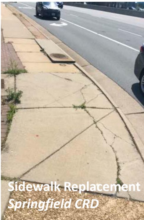
Sidewalk Replacement Springfield CRD