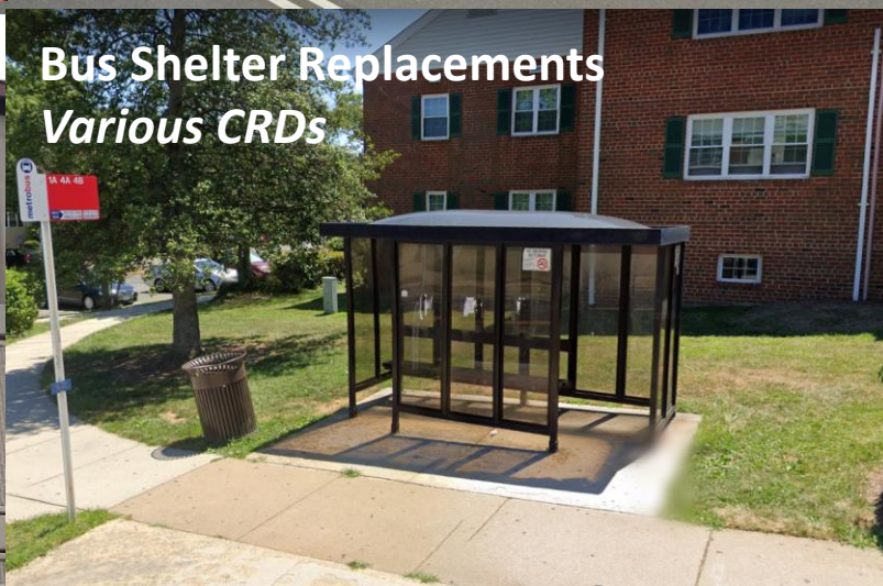
Bus Shelter Replacements Various CRDs