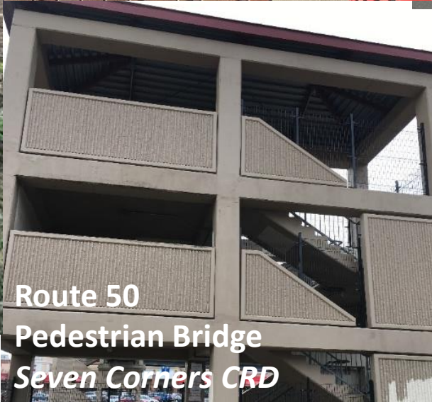
Route 50 Pedestrian Bridge Seven Corners CRD