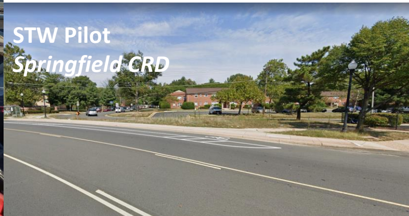
STW Pilot Springfield CRD