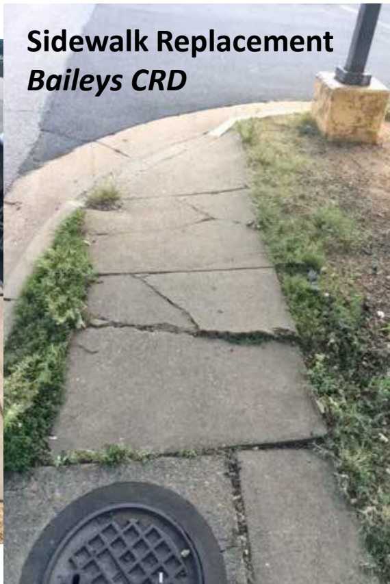
Sidewalk Replacement Baileys CRD