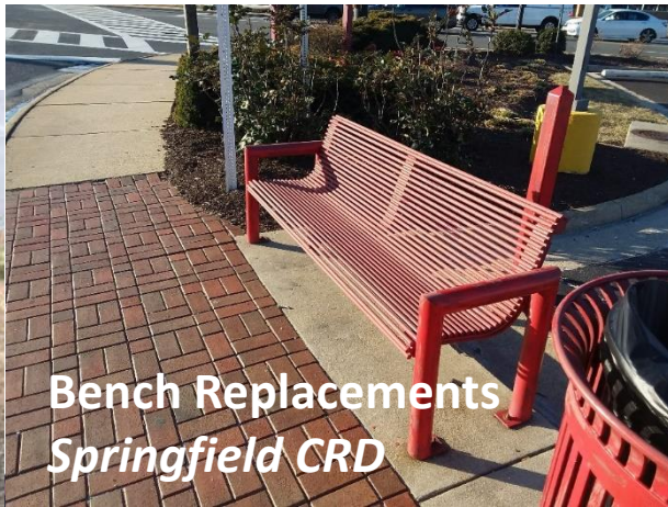
Bench Replacements Springfield CRD