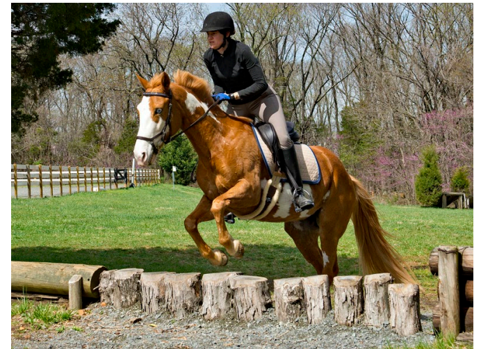
Riding or Boarding Stable