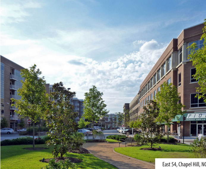
East 54, Chapel Hill, NC