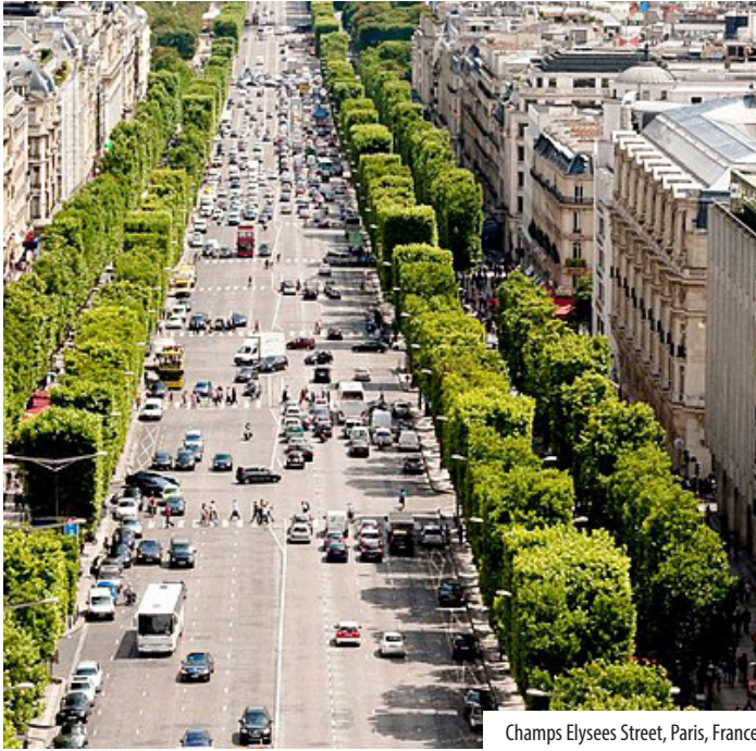
TOP Champs Elysees is a well-known example of boulevard with a wide sidewalk and Building Zone designed to provide relief along a busy roadway