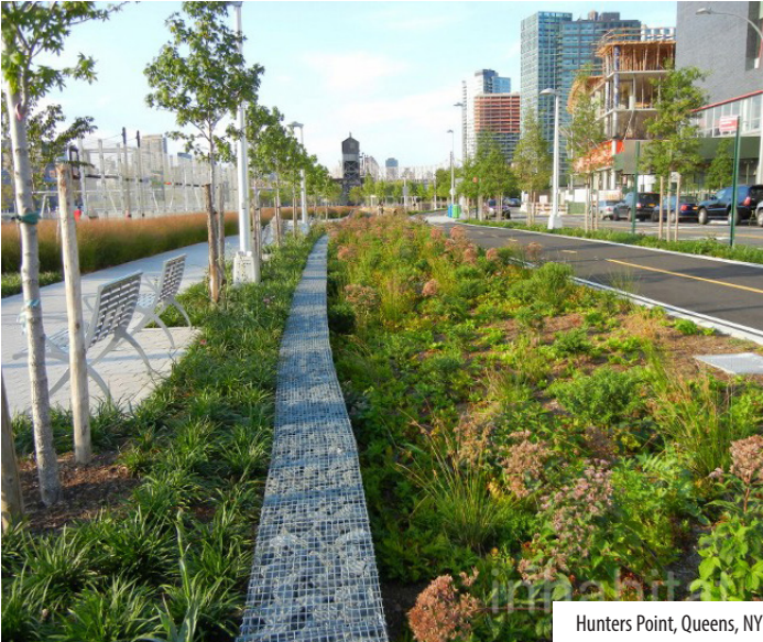
Hunters Point, Queens, NY