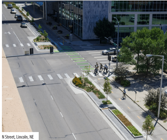
N Street, Lincoln, NE

Landscaped cycle track that protects cyclists adjacent to a busy roadway and incorporates stormwater retention