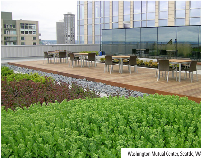
BOTTOM Green roof that combines stormwater capture, native plantings, and outdoor cafe seating