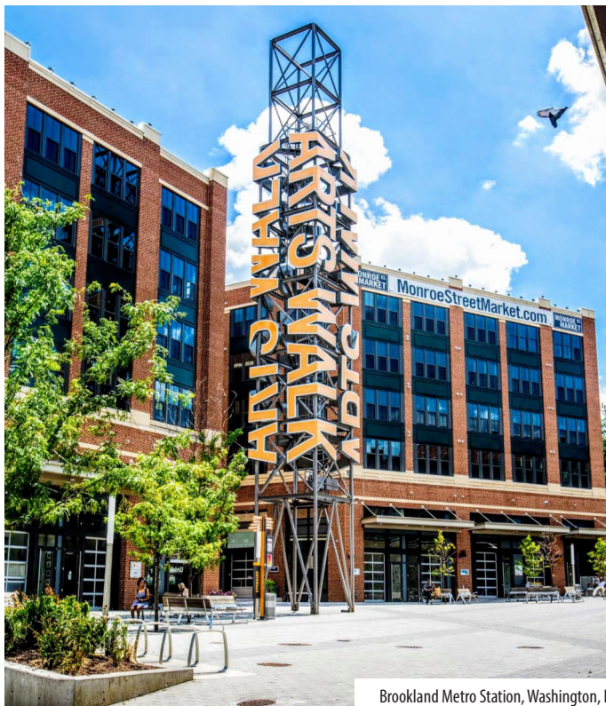
Brookland Metro Station, Washington, DC

LEFT Development, including commercial uses, building entrances, and open spaces, that is oriented around a transit station to create a focal point