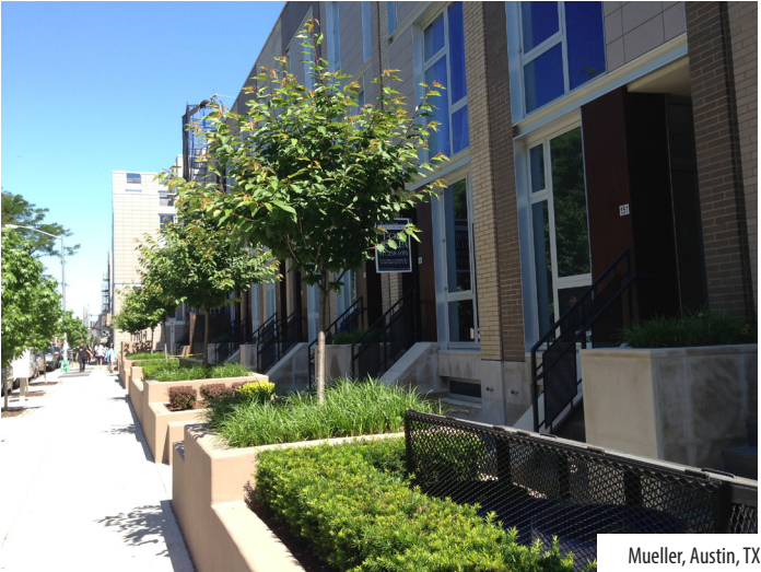
Mueller, Austin, TX