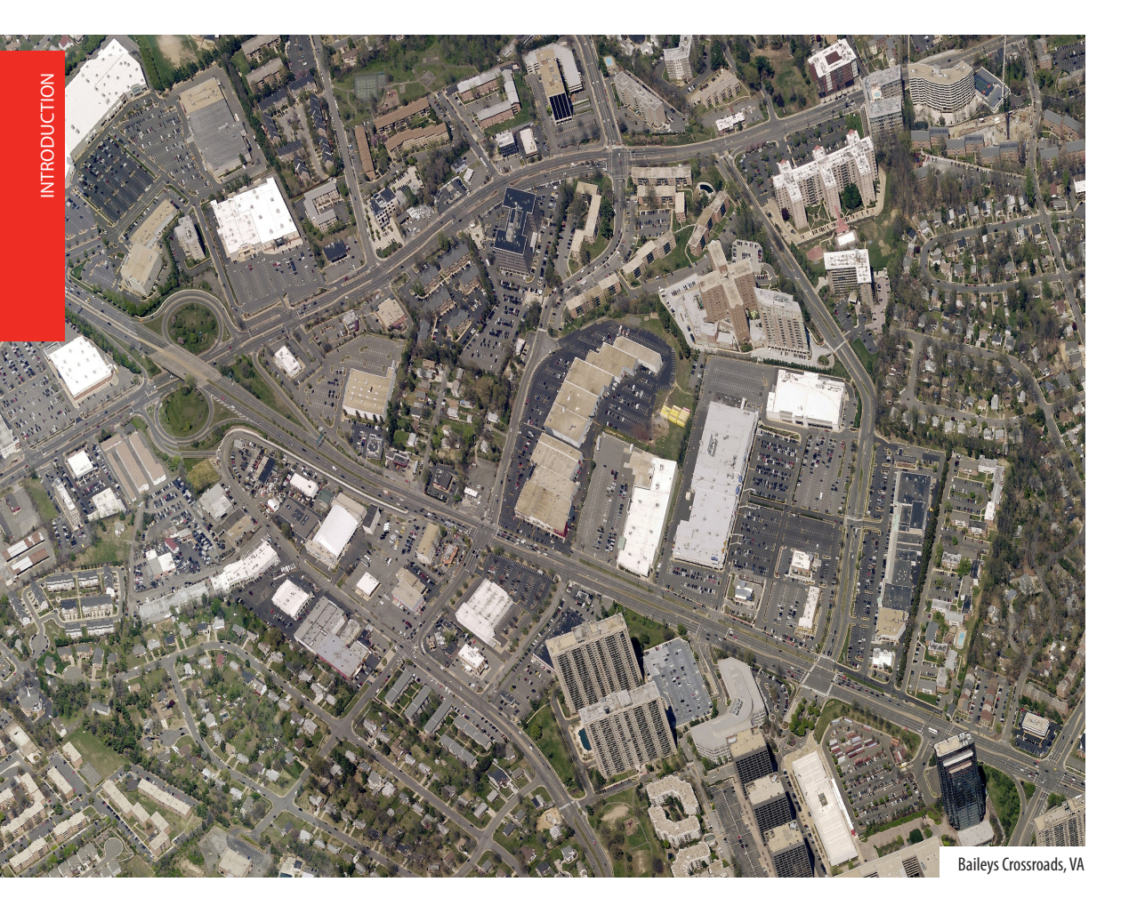
Baileys Crossroads CRD aerial depicts the intersection of Columbia Pike and Leesburg Pike on the left side of the graphic; the Town Center area is shown in the center of the graphic