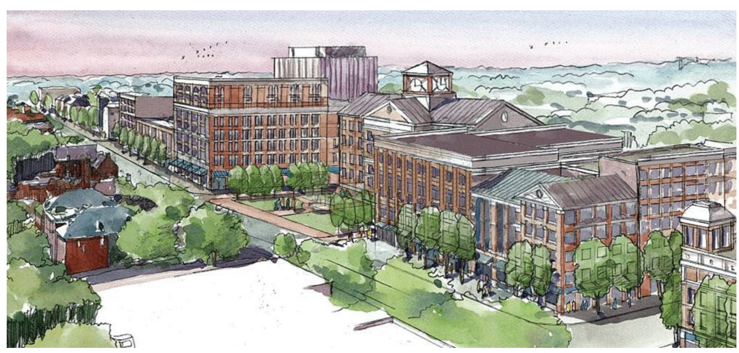
Columbia Pike (Artist's Rendering), Columbia Pike Initiative Update, 2005