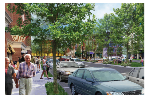
Bailey's Crossroads Vision (Artist's Rendering)

2012 Arlington County, Columbia Pike Neighborhoods Plan