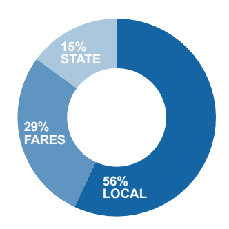
Anticipated, Approximate O&M Funding Sources

56% Arlington County and Fairfax County 29% Ridership and Fare Revenue