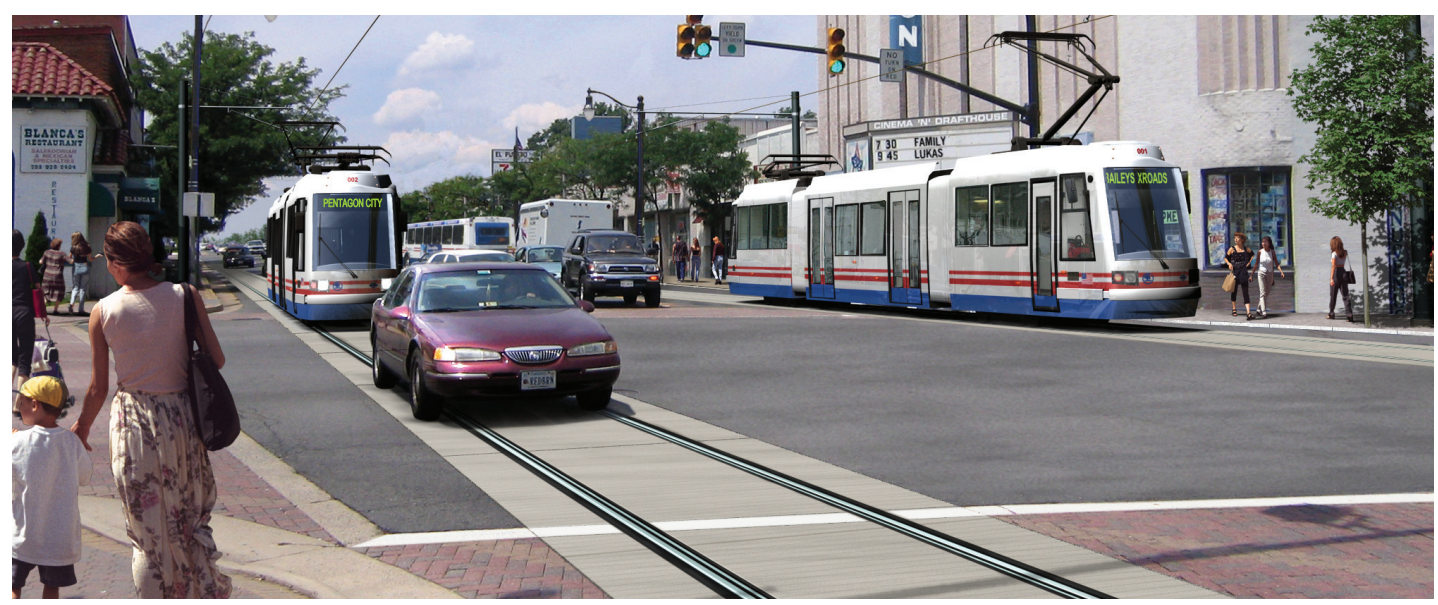
Proposed Station Stop at Walter Reed Drive (Artist's Rendering)