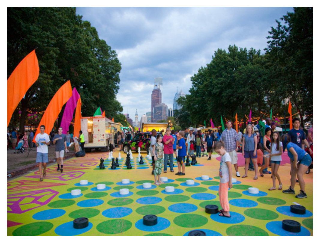
Using paint and whimsical color to create community-driven pop-up events, such as this one in Philadelphia, can liven up the study area and make it more active.

The Panel further recommended testing the location of this temporary plaza with a series of community driven pop-up events. They shared multiple ways of demarcating this new public space — creation of a pop-up plaza by painting the ground with vibrant patterns, painting in a chess board for children and adults to play outdoors, hosting a farmer's market or a food truck festival. The space could also be a pop-up park by painting or rolling out artificial turf and laying out benches and potted planters for outdoor community lounging on summer weekends. These are fairly inexpensive ways to bring the community together, and test the location and range of possible activities in the demarcated area for the long-term town green. The Panel also indicated the importance of having a schedule of events in place for the temporary plaza to successfully transform into a cultural focal point for the community.