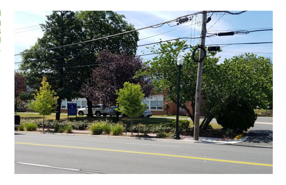
Fairfax County has invested resources in streetscaping portions of Annandale's sidewalks.

Additionally, because the area is flanked with multiple property owners and small parcel sizes, redevelopment opportunities are limited. The need for broader business stakeholder engagement could ultimately assist with creating a brand and promoting the area, but currently, this engagement is extremely limited. Finally, there seems to be an understanding that new residential development would help drive transformation, but for economic reasons, it is highly unlikely that the market could support such an approach to revitalization.