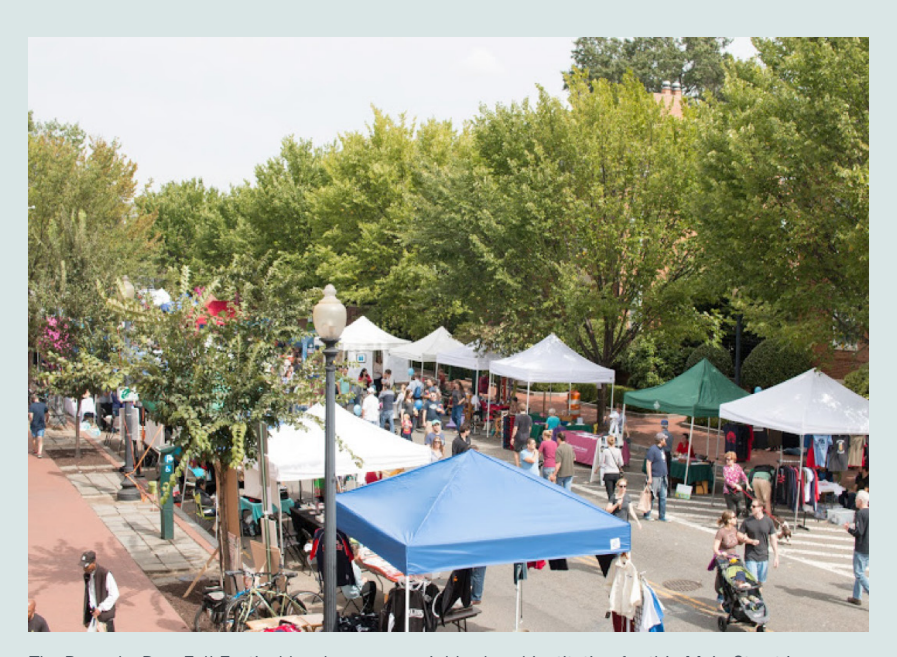
The Barracks Row Fall Festival has become a neighborhood institution for this Main Street in Washington, DC.

Barracks Row in Washington, DC provides a successful example of leveraging a Main Street program. Located five blocks east of 8th Street, SE from Pennsylvania Avenue to M Street, SW, Barracks Row is directly adjacent to a historical residential area in the District's Capitol Hill neighborhood. The corridor is now home to lots of restaurants and neighborhood-serving businesses, and serves as a regional draw. Several annual events for business promotion and activities for residents - including an annual July 4th parade and a Fall Festival – have become a tradition in the area too. Barracks Row Main Street also has its own branding, signage, and website. Learn more at http:// www.barracksrow.org/.