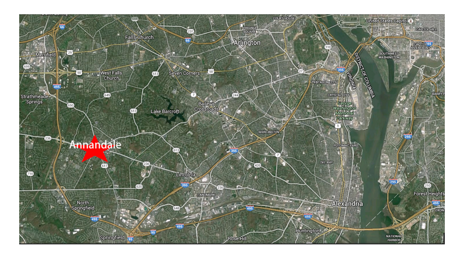
Map source: Sponsor briefing materials.

Annandale is located in the Mason District of Fairfax County, approximately 15 miles southwest of Washington, DC. Annandale is a unique community with a multicultural population, many longtime residents in the surrounding neighborhoods, strong community spirit exemplified by year-round community events, and a well-known Korean restaurant scene. The TAP concentrated on the Annandale Commercial Revitalization District (CRD), and in particular on the "downtown" core along Columbia Pike. Annandale underwent a Comprehensive Plan update in 2010 that provides the framework for major redevelopment, but has experienced little change thus far. Most new development remains by-right, parcel by parcel activity, and the area's appearance suffers from building deterioration and code compliance violations. While Fairfax County has made extensive streetscape investments in the community, the TAP sponsor requested that the Panel recommend a holistic range of strategies for revitalization that concentrate on short- and medium-term achievable results.